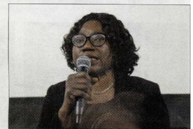
"Don't be afraid to make a mistake. Step out of your comfort zone."